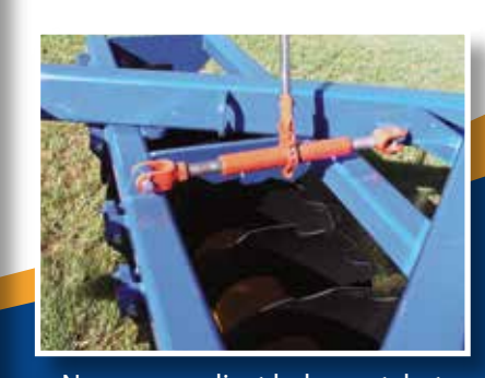
New gang adjust helper ratchet